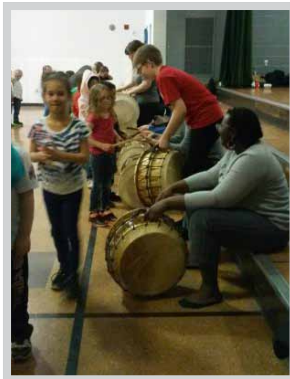
KOREAN 5400 STUDENTS VISIT THE GRAHAM SCHOOL TO SHARE KOREAN CULTURE WITH LOCAL CHILDREN.