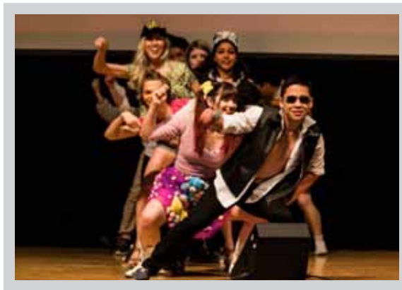
JSO MEMBERS PUT ON A FASHION SHOW AT THE SPRING FESTIVAL.

The Japanese Student Organization at The Ohio State University presented the 10th Annual Japanese Spring Festival on Sunday, March 8 in the Performance Hall of the Ohio Union. Japanese calligraphy, tea ceremony, origami, traditional games, martial arts, music and authentic Japanese food and refreshments were featured at the event. New this year was a chance for attendees to purchase donated items at a flea market to benefit the Gifts of Kindness Fund, which was established by the Columbus Foundation to provide assistance to individuals who have experienced an unforeseen setback. The spring festival was co-sponsored by the Institute for Japanese Studies, Tensuke Market, Global Touch, JASCO, Access 2 Interpreters and Yamato Transport U.S.A.