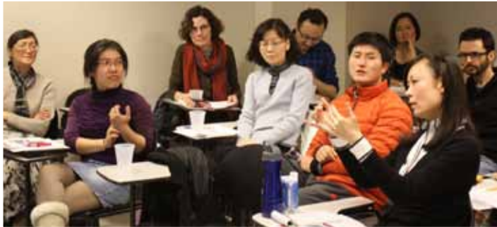
PARTICIPANTS OF THE 2014 ICS GRADUATE FORUM DISCUSS PRESENTATIONS.