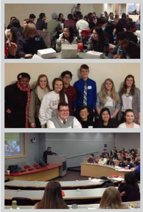
LOCAL HIGH SCHOOL STUDENTS VISIT OSU FOR CHINESE LANGUAGE AND CULTURE DAY 2015.