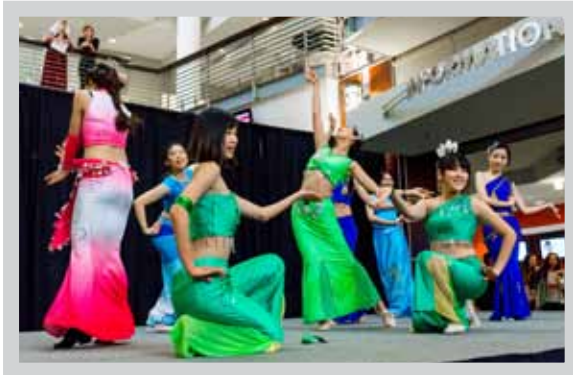
DANCE OF THE SOUL FROM CHINA PERFORMS AT TASTE OF OSU.